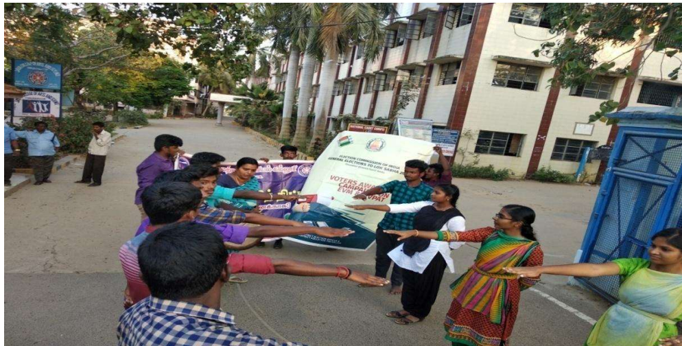
Voting Awareness programme (2021-2022)