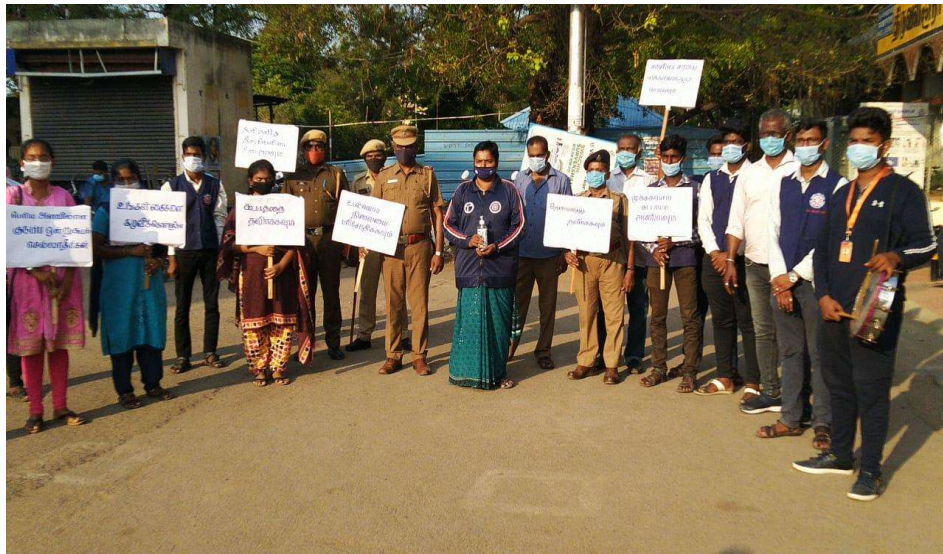
Covid19 consciousness (2021-2022)