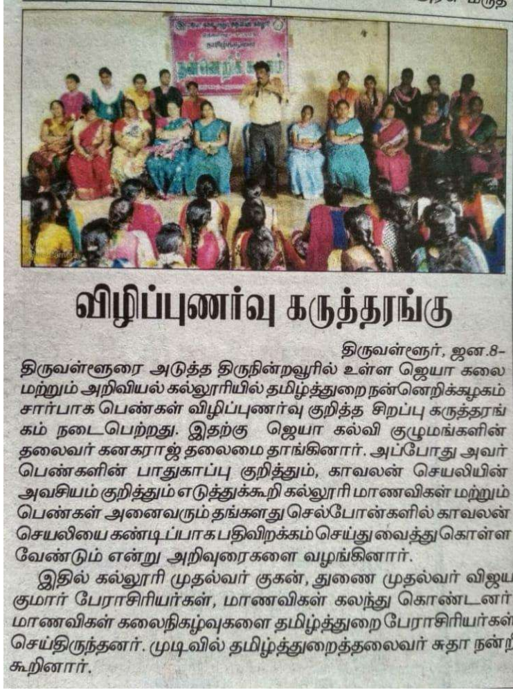
Understanding of Women's Empowerment 2021-2022