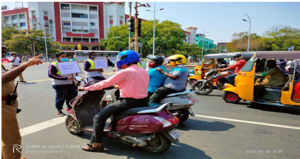
Road Safety Awareness 06/02/2021