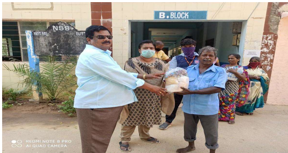
Provided provisions during Covid-19 to sweepers and helpers in our college (2021-2022)