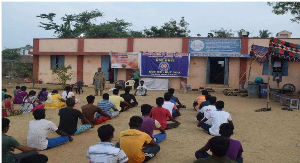
Creating knowledge of yoga at Koovam village in 2021-2022.