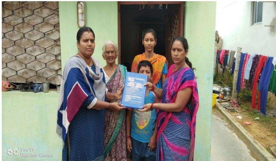
Awareness of Jeevan Yojana (2021-2022)