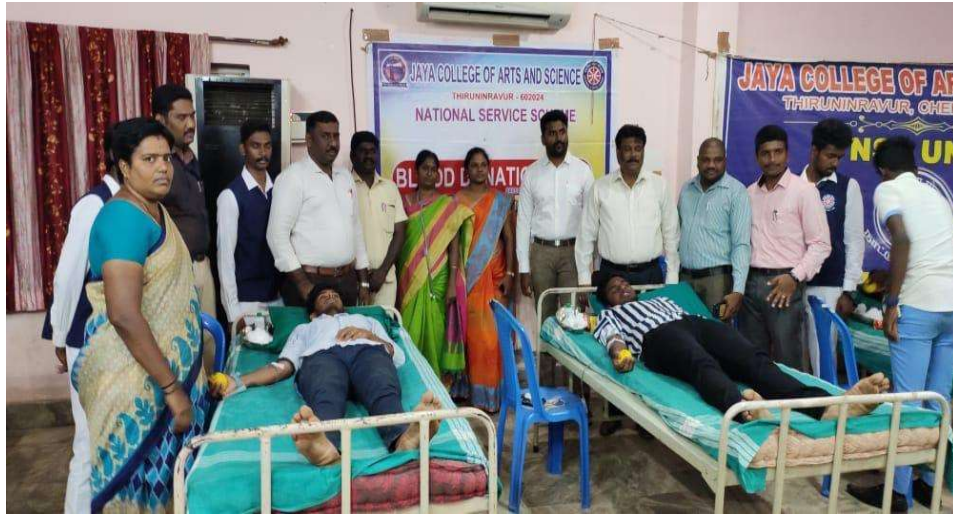
Our College NSS Units Conducted a Blood Donation Camp on 2021-2022

Our college regularly holds awareness campaigns through its NSS Unit, such as a Blood donation camp, voting Awareness programme, understanding of women's empowerment, knowledge of the yoga programme, covid 19 consciousness, road safety awareness, and awareness of Jeevan Yojana to encourage the next generation of leaders to uphold human values and fulfill their constitutional duties.