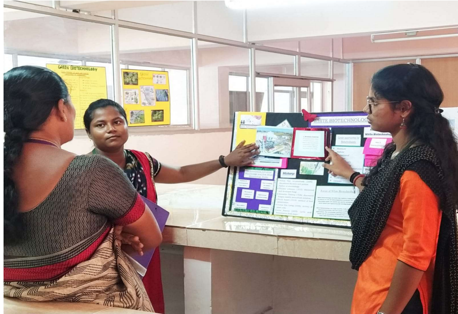
Presentation by the students of Biotechnology Department