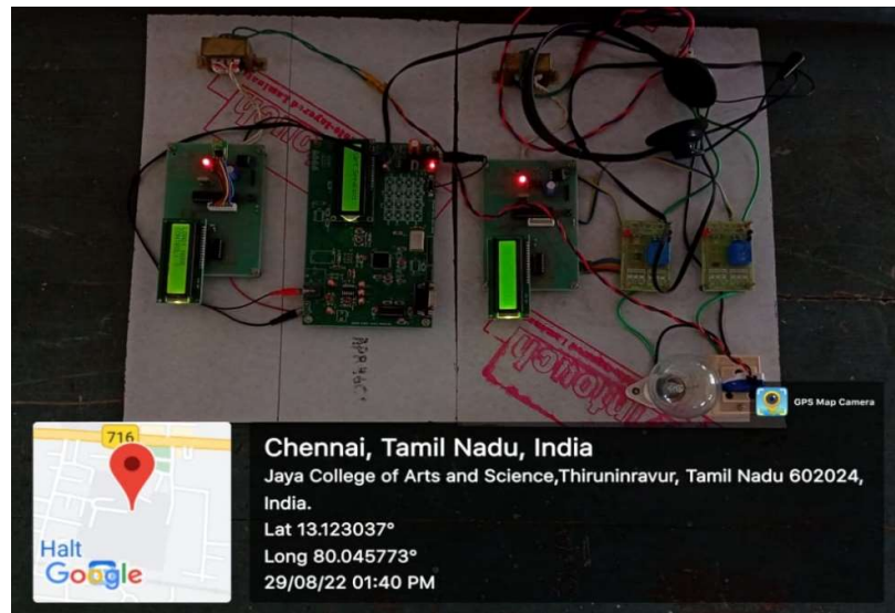
Voice recognition for automatic on/off control