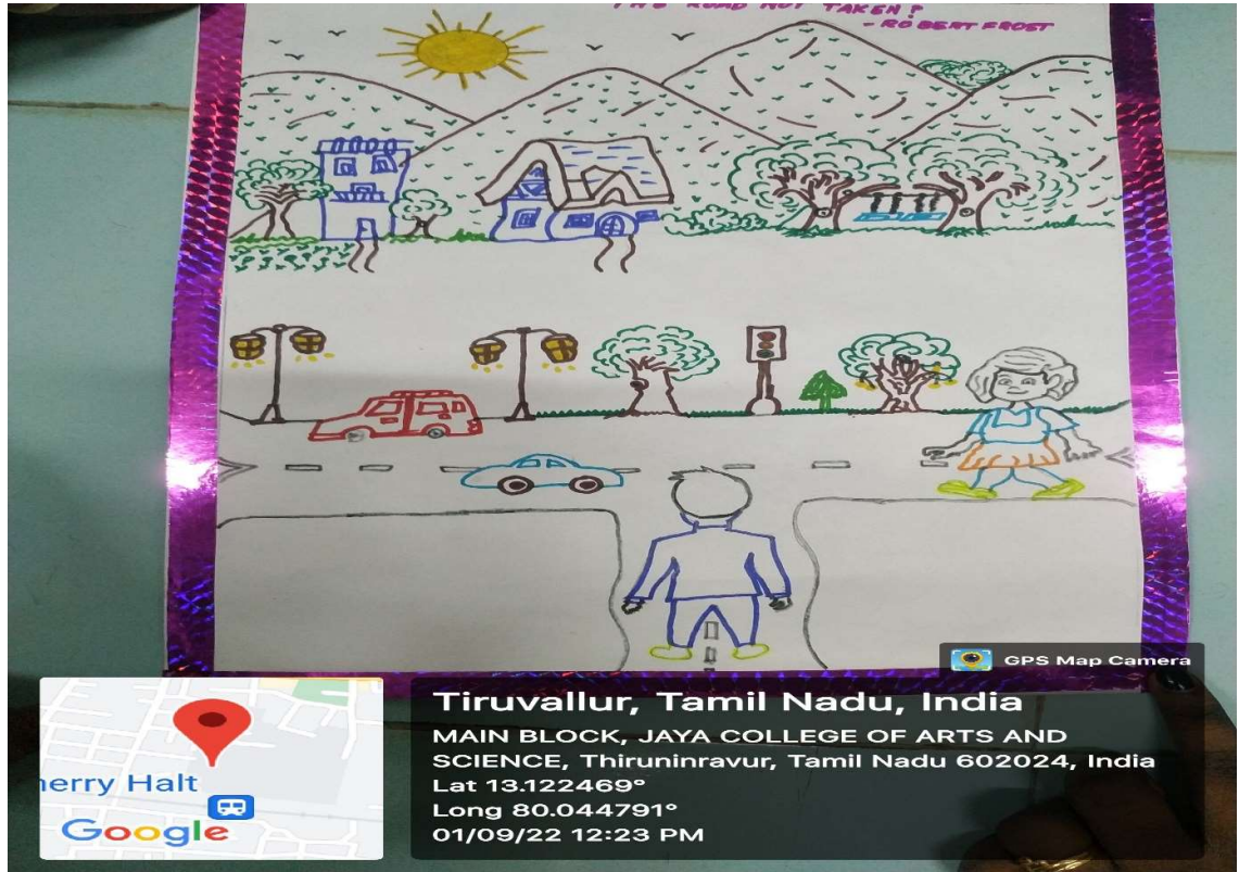
Diagrammatic representation done by Literature Students