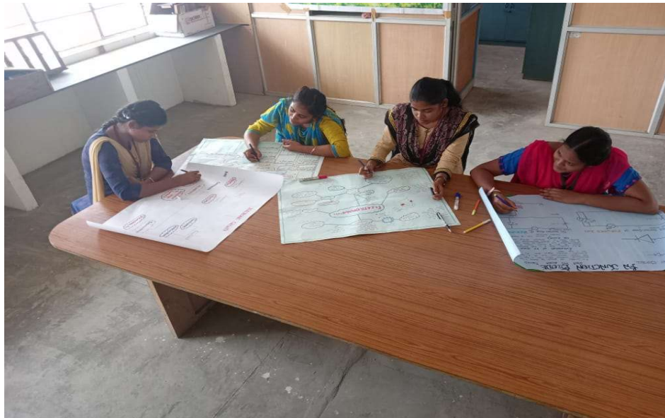
Mind mapping by the Department of ECS and physics students

The technique of mind mapping is available in almost every department. This provides a significant contribution to students' learning, especially the implementation of the constructivist approach prepared by the students themselves inside the classroom.