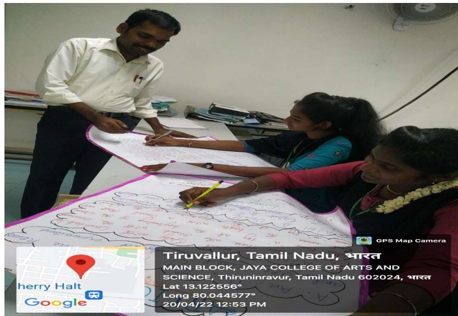
Mind mapping by the students of the Department of English