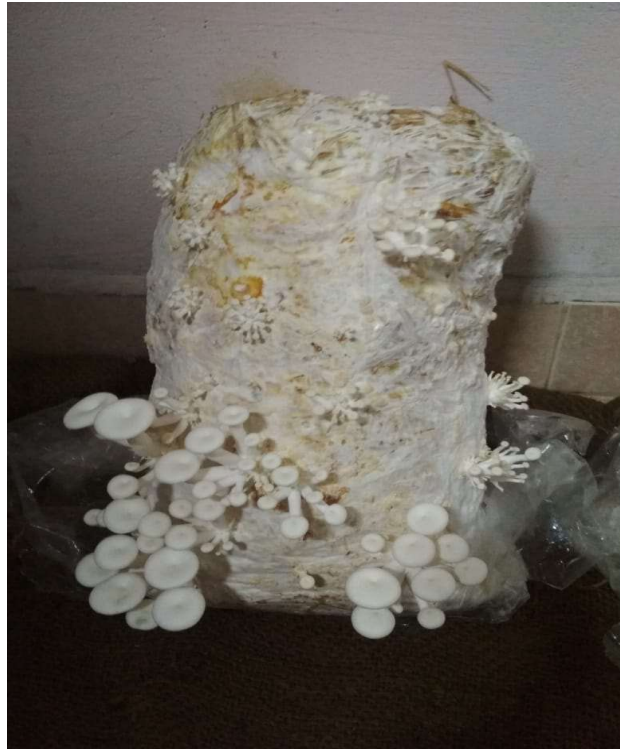
Students from the biotechnology department cultivated mushrooms