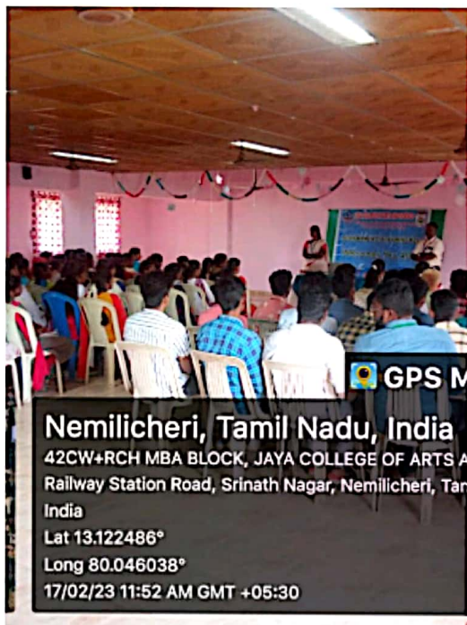
GPS M Nemilicheri, Tamil Nadu, India 42CW+RCH MBA BLOCK, JAYA COLLEGE OF ARTS A Railway Station Road, Srinath Nagar, Nemilicheri, Tan India Lat 13.122486° Long 80.046038° 17/02/23 11:52 AM GMT +05:30