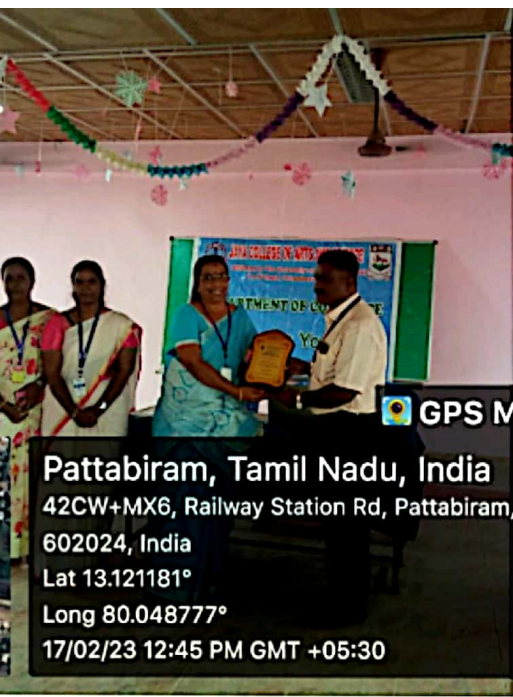
GPS M Pattabiram, Tamil Nadu, India 42CW+MX6, Railway Station Rd, Pattabiram, 602024, India Lat 13.121181° Long 80.048777° 17/02/23 12:45 PM GMT +05:30