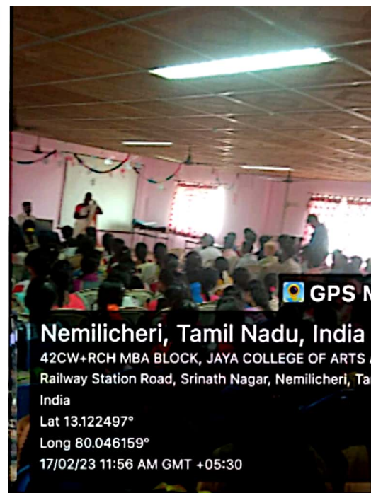
GPS M Nemilicheri, Tamil Nadu, India 42CW+RCH MBA BLOCK, JAYA COLLEGE OF ARTS Railway Station Road, Srinath Nagar, Nemilicheri, Ta India Lat 13.122497° Long 80.046159° 17/02/23 11:56 AM GMT +05:30