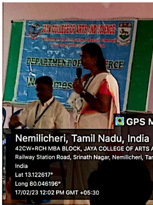
GPS M Nemilicheri, Tamil Nadu, India 42CW+RCH MBA BLOCK, JAYA COLLEGE OF ARTS A Railway Station Road, Srinath Nagar, Nemilicheri, Tam India Lat 13.122617° Long 80.046196° 17/02/23 12:02 PM GMT +05:30