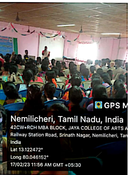
GPS M Nemilicheri, Tamil Nadu, India 42CW+RCH MBA BLOCK, JAYA COLLEGE OF ARTS A Railway Station Road, Srinath Nagar, Nemilicheri, Tan India Lat 13.122472° Long 80.046152° 17/02/23 11:56 AM GMT +05:30