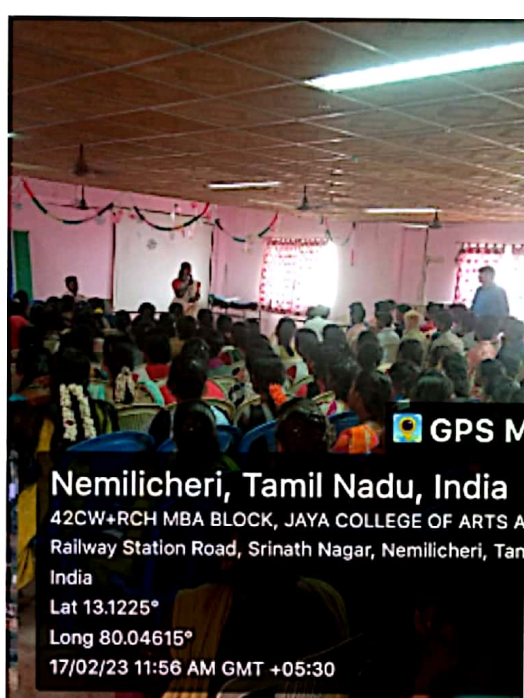
GPS M Nemilicheri, Tamil Nadu, India 42CW+RCH MBA BLOCK, JAYA COLLEGE OF ARTS A Railway Station Road, Srinath Nagar, Nemilicheri, Tan India Lat 13.1225° Long 80.04615° 17/02/23 11:56 AM GMT +05:30