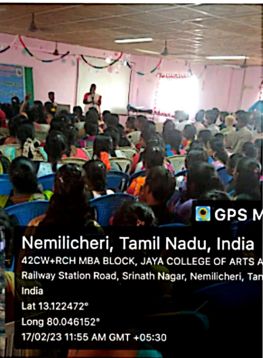
GPS M Nemilicheri, Tamil Nadu, India 42CW+RCH MBA BLOCK, JAYA COLLEGE OF ARTS A Railway Station Road, Srinath Nagar, Nemilicheri, Tan India Lat 13.122472° Long 80.046152° 17/02/23 11:55 AM GMT +05:30