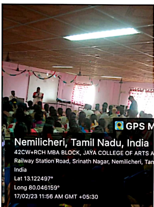
GPS M Nemilicheri, Tamil Nadu, India 42CW+RCH MBA BLOCK, JAYA COLLEGE OF ARTS A Railway Station Road, Srinath Nagar, Nemilicheri, Tan India Lat 13.122497° Long 80.046159° 17/02/23 11:56 AM GMT +05:30