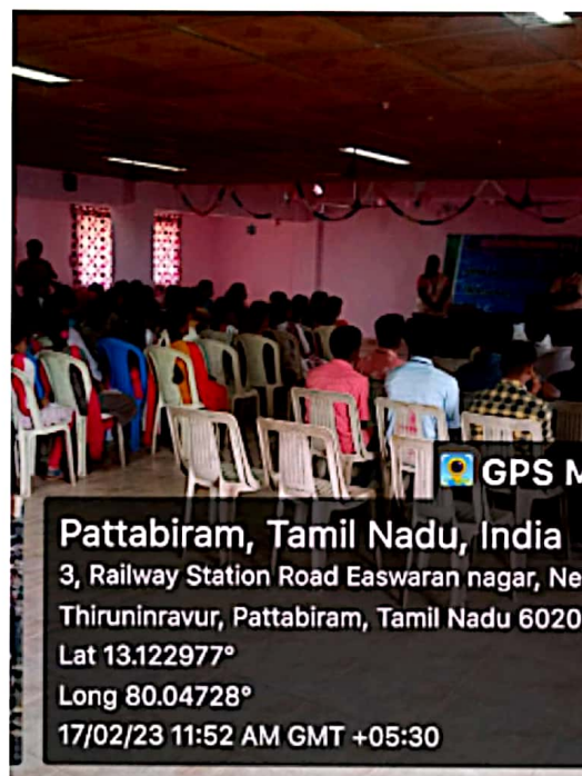
GPS M Pattabiram, Tamil Nadu, India 3, Railway Station Road Easwaran nagar, Ne Thiruninravur, Pattabiram, Tamil Nadu 6020 Lat 13.122977° Long 80.04728° 17/02/23 11:52 AM GMT +05:30