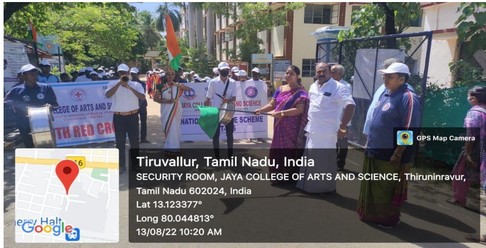
RALLY BY THE RED CROSS, NSS, NCC ON FLAG DAY