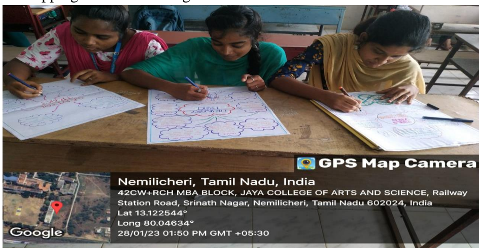
Mind mapping done by II B. Sc Microbiology

• Mind mapping method and diagrammatic articulation of ideas.